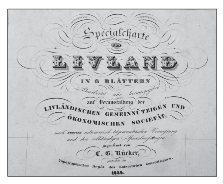
Figure 1. Downscaled cartouche on Sheet VI. Map Department Berlin State Library: Prussian Cultural Heritage, Kart. Q 16236

The Specialcharte von Livland shows the territory of Livland without its island Oesel and the neighboring guberniyas Estland and Kurland, St. Petersburg, Pskov, and Vitebsk. Livland is mapped at a middle scale of roughly 1:185,000 on six sheets.<sup>3</sup> The first edition of the map is a copperplate print on paper without any further coloration.<sup>4</sup> Using Latin letters, the language of the map's title, legend and toponymy is German.