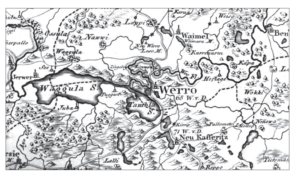
Figure 3. Downscaled extract from Sheet 5 (1798) of the Atlas von Liefland. Map Department Berlin State Library: Prussian Cultural Heritage, Kart. Q 15663a